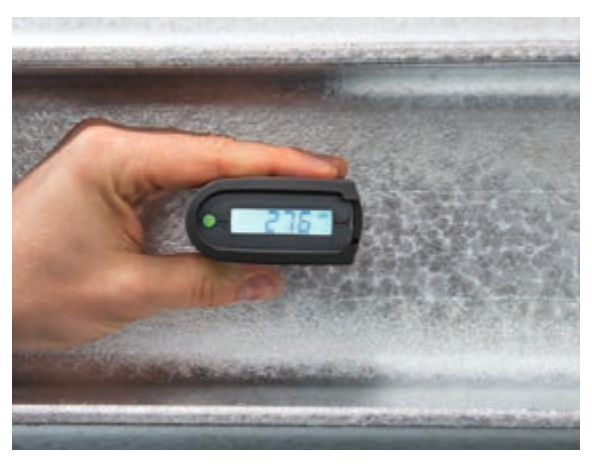
An LED shows immediately whether the value is within tolerance

To ensure stable positioning on the sample, the devices are equipped with a three-point support. That combined with curvature compensation guarantees reliable measurements even on non-flat surfaces.