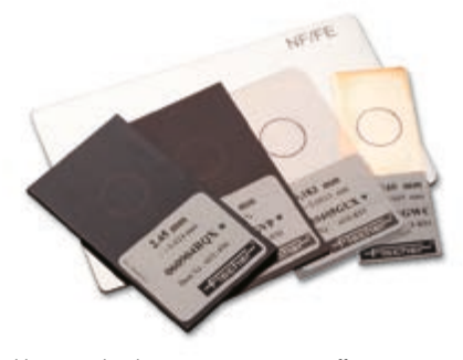
As a DAkks-accredited company, FISCHER offers a variety of calibration standards

A USB port is available for transferring the data to a PC or laptop, where, using the FISCHER DataCenter software, the values are quickly imported and easy-to-read reports generated.