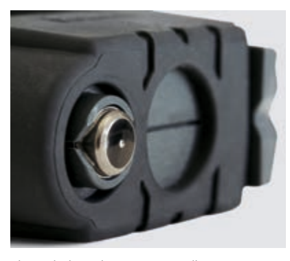
The carbide probe tip is especially wear-resistant and stands up to thousands of measurements

For fast and error-free reading of the measurement results, the devices are equipped with two lighted graphical displays. When measuring overhead or on slanted or vertical surfaces, the display rotates automatically. An LED on the top of the unit signals whether the value just taken is within the tolerances previously entered.